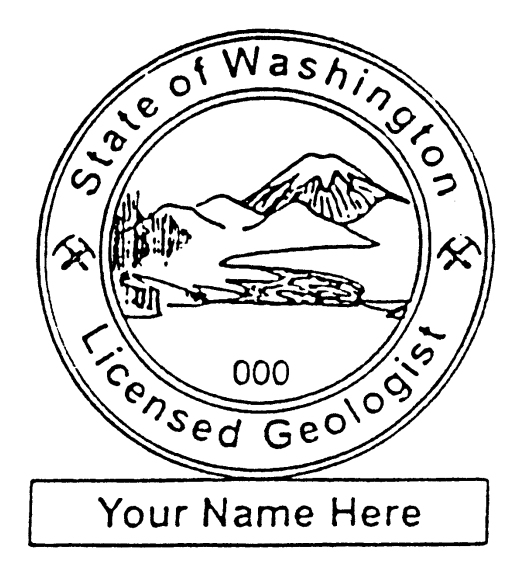
Engineering geologist stamp here